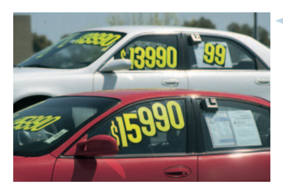
INVITATION TO NEGOTIATE

Very often invitations to negotiate are confused with genuine offers. Is a price tag on a sale item an offer or an invitation to negotiate?